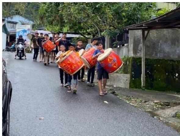
Si Muntu in the Nagari Paninjauan area of Agam District